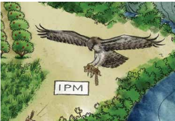
Beneficial natural processes, such as Integrated Pest Management (IPM), help to control rodents.

It is highly unlikely that farmers would ever intentionally sell contaminated produce. In the past, it was long held that common sense approaches were sufficient to ensure produce did not have food-borne pathogens. Animals were discouraged from production areas because they damaged crops. The potential for animal manures applied as fertilizers and soil amendments to result in water and crop contamination with human pathogens was well recognized. However, in 2006, everything changed when an outbreak of E. coli O157:H7 was traced back to a farm on California's Central coast, the center of the state's fresh-cut salad industry. While it was never unequivocally determined how the spinach became contaminated, non-native feral pigs, contaminated irrigation water, and adjacent cattle operations were all considered as possible sources. All wildlife and the habitat they occupied became scrutinized by public health, academia, and especially the leafy greens industry.