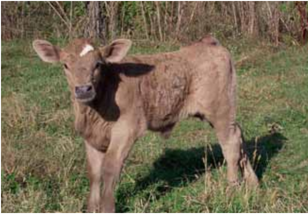
Young livestock are likely to carry higher levels of pathogens than adults.