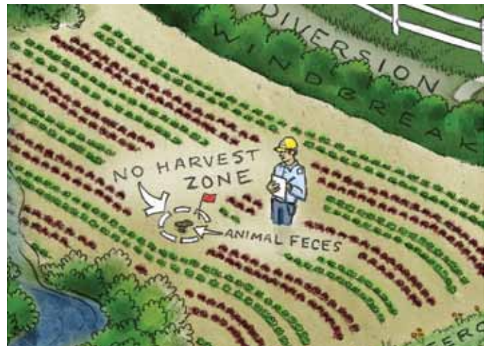
Periodically monitoring for animal damage or feces in the production field ensures a safe harvest.