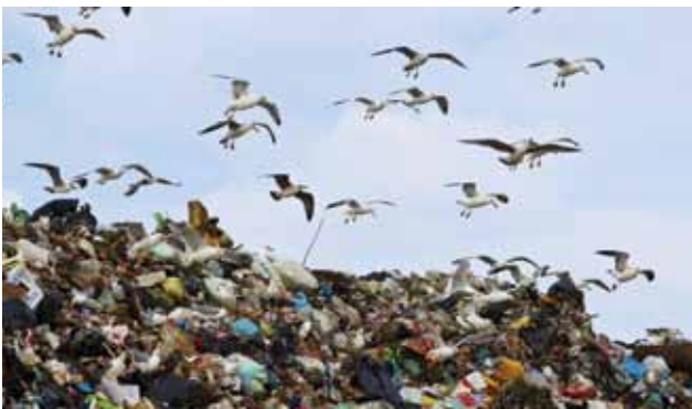
Wildlife living near areas with high levels of pathogens, such as these landfill-dwelling seagulls, may pose a greater risk of transferring pathogens than wildlife not associated with such areas.