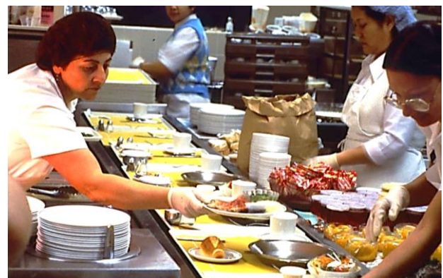
Hospital food service preparation area.