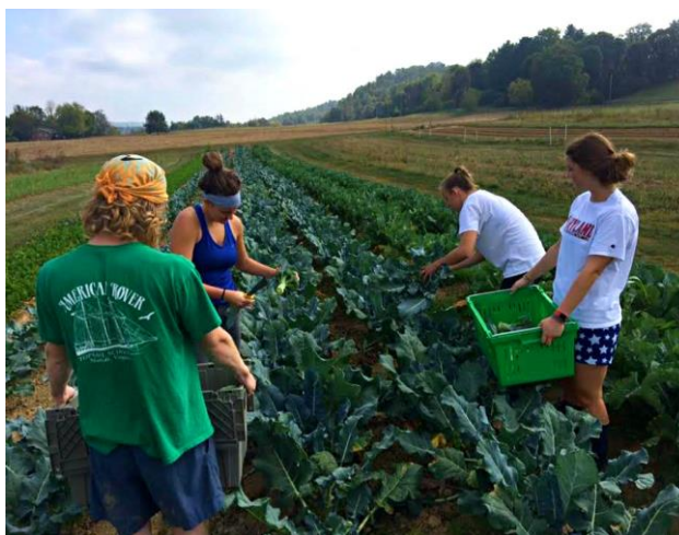
Students harvesting broccoli at Virginia Tech’s Dining Services acreage at Kentland farm.

Through a research study conducted through Harvard’s Food Law and Policy Clinic, the contributors highlight the importance of how universities and colleges should be capitalizing on the increasing demand of buying and eating local. They recommend that state colleges and universities gain a “competitive edge” by being more transparent with their food procurement practices. This in turn could raise the colleges’ and universities’ public ranking and would therefore give themselves a competitive edge in student recruitment. Collaborations, in which institutions grow a part of their produce at campus facilities, not only provide a fresh source of local foods for the dining hall, but also