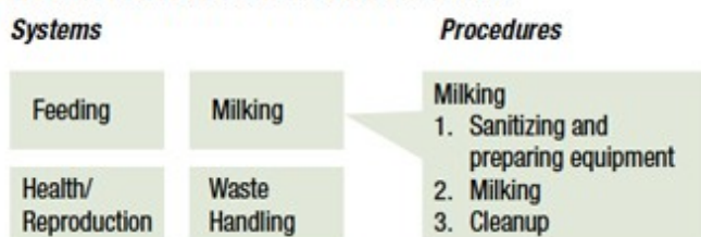
FIGURE 1. SYSTEMS AND PROCEDURES.

Producing a high-quality product at a profit depends on the consistent operation of all systems within the dairy. The basic systems shared by all dairy farm businesses are a milk harvesting system, an animal feeding system, and a waste management system (see Figure 1). Dairy farm success depends on how well these systems work together to produce large volumes of high-quality milk to sell.