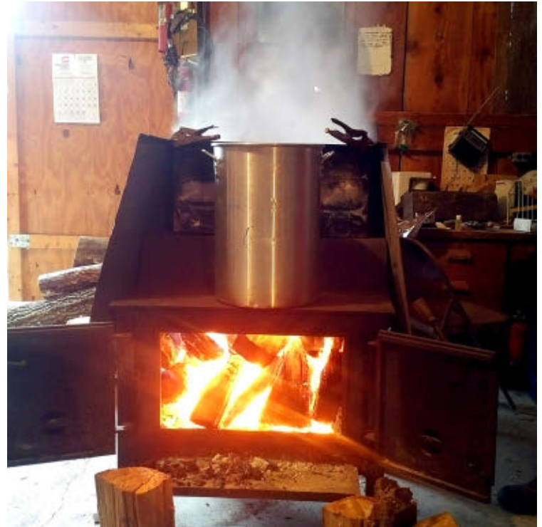
Figure 5. Boiling sap over an open fire to remove water and concentrate into syrup.