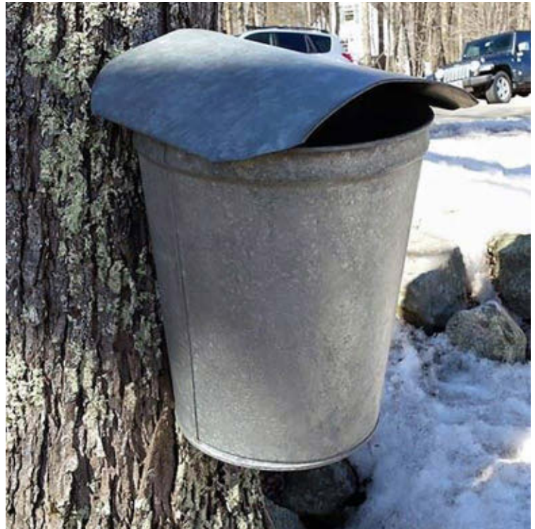
Figure 1. Covered bucket for maple sap collection.