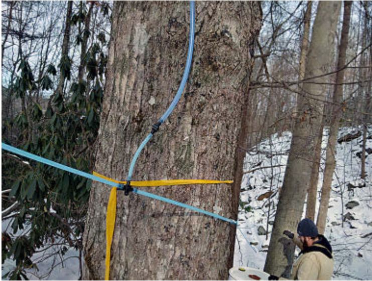
Figure 3. Plastic tubing connecting multiple trees collecting maple sap.