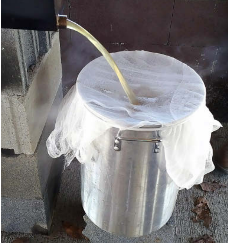
Figure 4. Filtering maple sap through cheesecloth to remove particulates. Use of cheesecloth is good for home use, but when processing syrup for sale, it should be filtered with an Orlon filter or filter press.