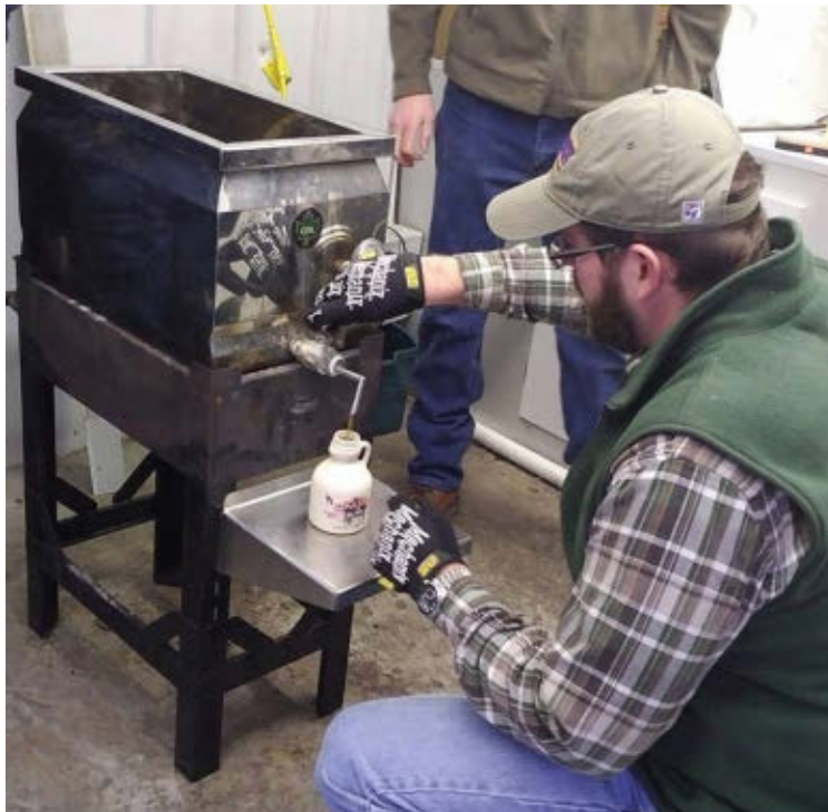
Figure 7. Bottling finished maple syrup for sale.