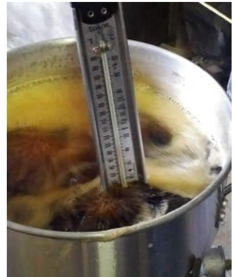
Figure 6. Using a candy thermometer to take the temperature of the syrup during cooking.