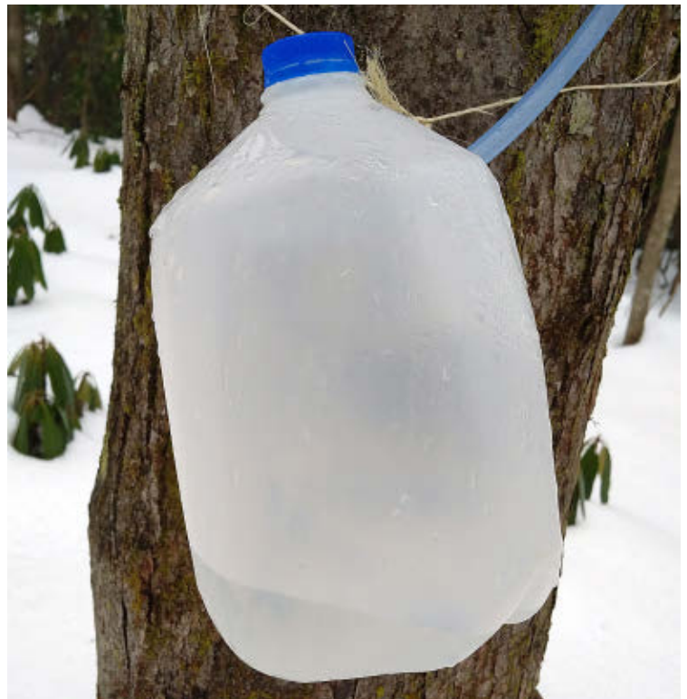
Figure 2. Plastic container with lid for maple sap collection.